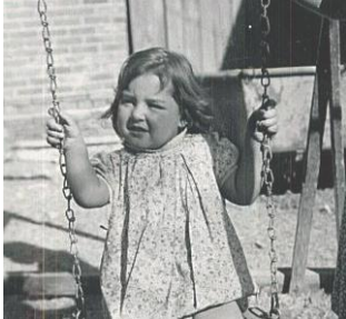
Me at 2