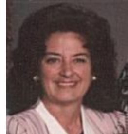
Me today [199?]

Went through all the heartaches a mother goes through when your son is in Vietnam. Our marriage ended in divorce after eighteen years in 1975.